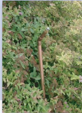
Nozzles (right) are placed at strategic locations based on landscaping and the structure of the home. The nozzles are connected to the pump/reservoir system (below).

Some mosquitoes are capable of transmitting diseases such as malaria, yellow fever, and the West Nile Virus.