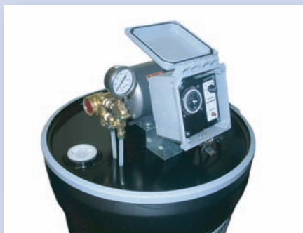
The nozzles are connected to the pump/reservoir (above) and are strategically placed throughout a facility.

The Auto Mist system automatically gives a synchronized spray through strategically placed nozzles that evenly distribute insecticide over an entire facility. No matter what type of facility you have, Auto Mist can give you safer insect control with water-based insecticides and peace of mind that insects aren't bothering your animals.